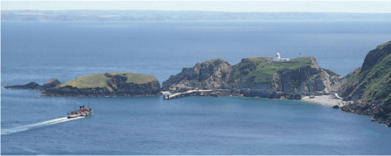
WAVERLEY, last of the paddle boats, heads for the jetty