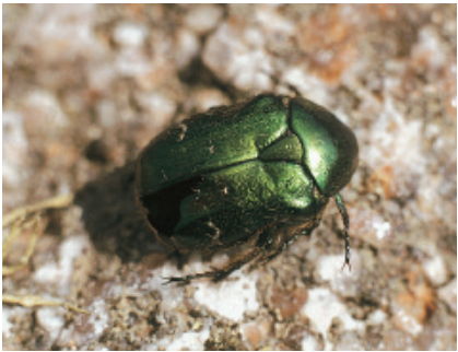
Rose Chafer Beetle