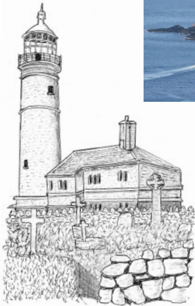
The Old Light and Keepers' Cottage